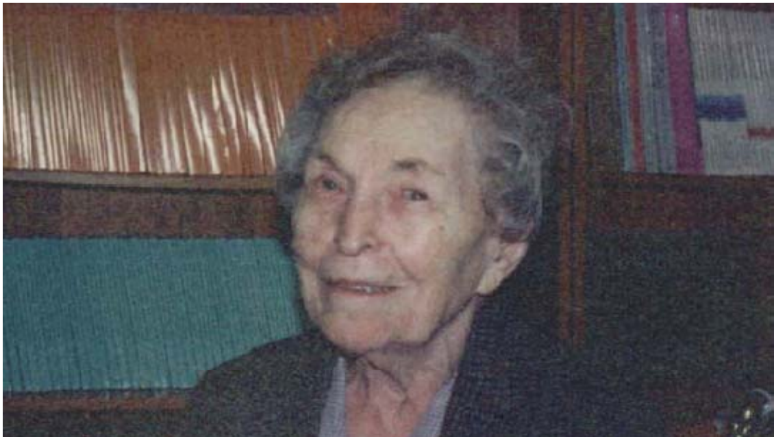
Figure 6. Anna J. Schwartz, at NBER New York office, December 2008.