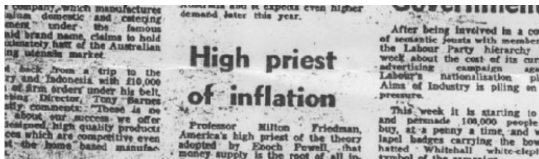
Figure 8. Birmingham Post item, August 21, 1974.

Friedman paid a one-week visit to the United Kingdom in September 1974, centered on an Institute of Economic Affairs conference on inflation. The Birmingham Post provided a short item previewing Friedman’s visit and giving a capsule description of his views on inflation. The piece was uncontroversial except for the title: the article was headed “High Priest of Inflation,” though the text of the article clearly meant to convey something closer to “High Priest of Inflation Theory.” Friedman employed a clippings service to keep track of U.K. press coverage of himself, and so saw the item. The copy of this article that is kept by the Birmingham Post office is shown in Figure 8. It contrasts with the copy of the article that is stored at the Hoover Archives, which has multiple exclamation marks that Friedman marked in red ink next to the headline to express his incredulity. As Friedman had occasion to say in a later, similar moment of exasperation, “Why in God’s name isn’t it possible for the news media, for journalists in radio and television and the newspapers, to use the English language correctly?” ( San Jose Mercury News , February 13, 1979.)