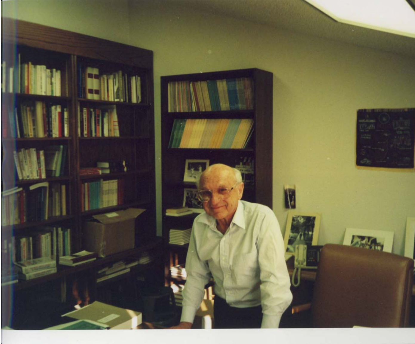
Figure 2. Milton Friedman, January 1992.

government intervention, through his depiction of the income-expanding effects of government purchases and his characterization of private investment demand as destabilizing. In addition, Friedman later argued that the underemployment-equilibrium argument in the General Theory was “highly congenial to the opponents of the market system” (Friedman and Schwartz, 1982, p. 43), and approvingly quoted a 1948 observation by his brother-in-law that “Lord Keynes provided a respectable foundation for the adherents of collectivism.” 22 Friedman’s verdict at the end of the 1970s was that the idea that “deficits... were a way of expanding the economy” led to a “tremendous