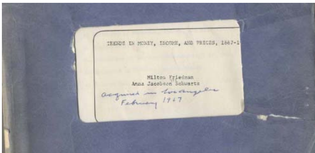
Figure 7. November 1966 Friedman-Schwartz Trends draft.

and... the aid of modern computers.” 137 “Whatever you have done that Fisher didn’t do,” Cagan wrote, “computers didn’t make that much difference. He carried out rather extensive computations.” Friedman and Schwartz deleted this passage and their revision made no claim about the modern nature of their statistical procedures, a most wise change in light of later developments.